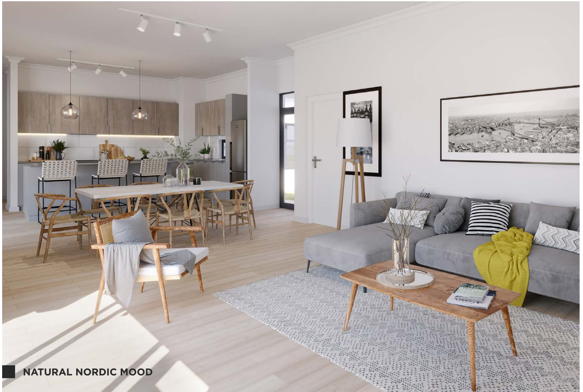
NATURAL NORDIC MOOD