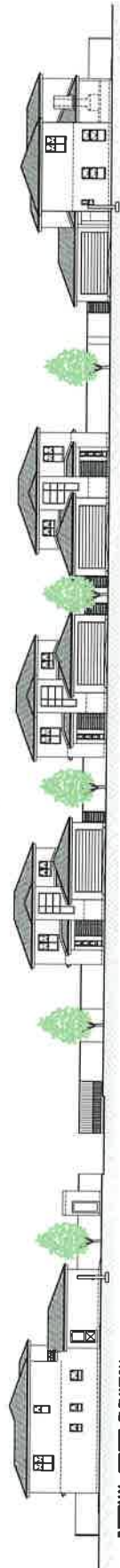
INTERNAL STREET ELEVATION: S.E. 1/4